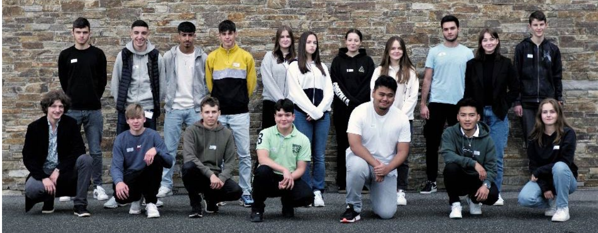
The new apprentices at Hilti Aktiengesellschaft in Schaan (shown here with three colleagues from Hilti Schweiz AG) begin their vocational training in six different specialist fields.