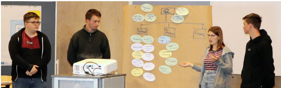
The apprentices in the 3 rd year of apprenticeship started their junior company (JUFA) with a workshop.