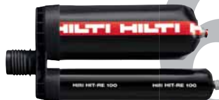
Injectable Mortar HIT RE-100