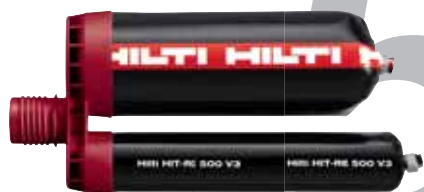
Injectable Mortar HIT RE-500 V3