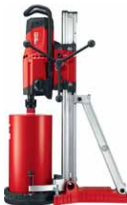
Diamond Coring tool DD 200