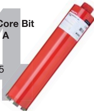
Diamond Core Bit DD-B UCL A