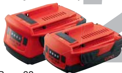
Battery Pack B 22/5.2 Li-Ion Battery Pack B 22/2.6 Li-Ion